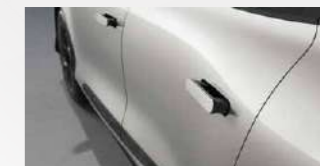
Automatic Flush Door Handles