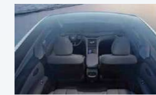
Double-Gazed Silvering Thermal Glassroof