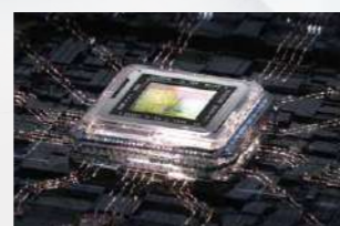
Intelligent Cabin Powered by Qualcomm Snap Dragon 8295