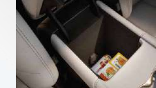
Intelligent Cold Warm Box