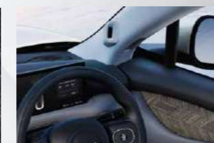
Driver Monitoring System

Light-weight Multi-Link Independent Rear Suspension