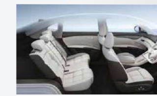
Spacious Passenger Space