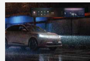
Rainy Night Mode