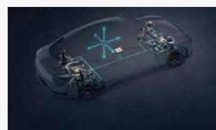
Intelligent Digital Chassis