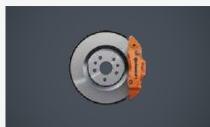
Continental 4-Piston Fixed Calipers