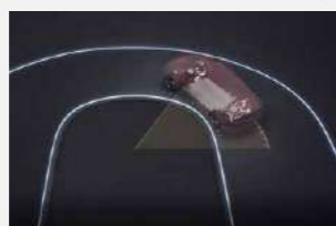
4.5m Turning Radius