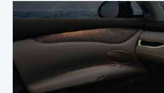
256 Ambient Lighting