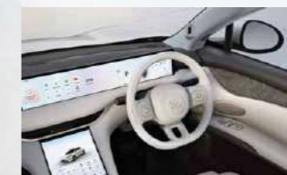
Sporty Steering Wheel