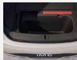
24 Storage Component